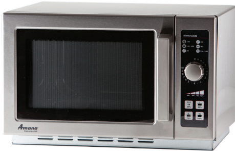
Model RCS10DSE shown